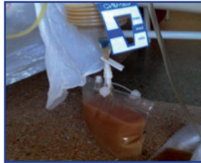
3rd treatment with MOMOSAN black