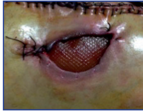
Application of MOMOSAN white (24x16x-1cm) and placing of the NPWT („THESES“) after the surgery.