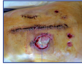
Examination after 4 days.