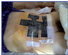
6th treatment after a further 5 days